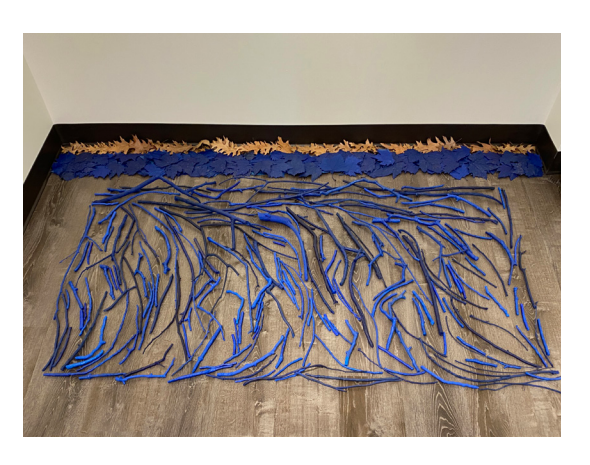
ZERO: Consciousness Unconscious 2021 | Mixed Media installation