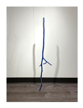
ZERO: Borrow | 2021 Mixed Media installation