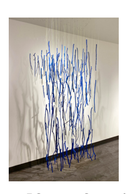
ZERO: Deep Ocean (Central Park) 2021 | Mixed Media installation